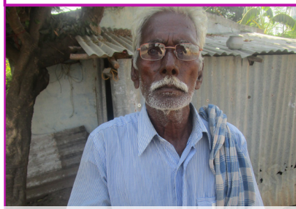
Village man with prescribed glasses

Healthcare services in many rural villages were non-existent when we started. Now, with your support, access to healthcare for over 100 rural communities has been created by mobile clinics staffed by qualified doctors, with free medicine provided for those who cannot afford it. Two Jeeps were purchased for these clinics, thus enabling patients to get medical help without travelling many miles and giving up a day's pay in order to go to a government health centre.