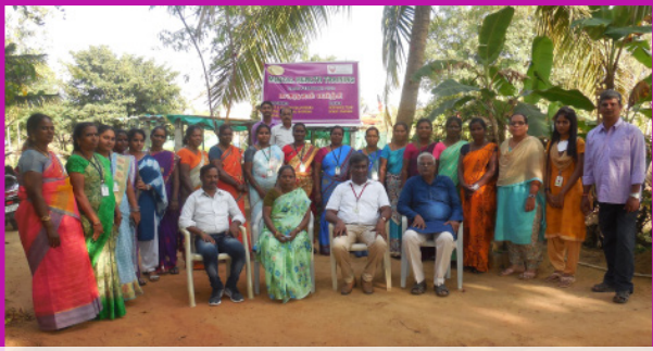
Health care workers and training staff

In February, CRUSADE staff and village health care workers attended a three-day mental health training course. A team from SCARF (Schizophrenia Research Foundation) in Chennai, led the programme. Training covered addictions, symptoms of mental health, coping mechanisms, and misconceptions. Attendees reported that the training offered good exposure to mental health concerns, and animators reported that they felt more comfortable identifying and supporting concerns in the future.