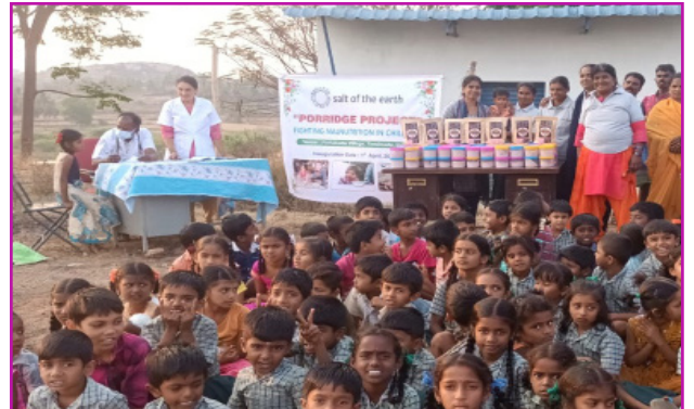
Porridge project launch, April 2022

To help combat child malnutrition, MASARD have launched a Porridge project. Funded by SOTE, 75 children will receive a nutritious health mix for six months. MASARD village animators are distributing the health mix to families on a weekly basis. Children's weight and statistics will be monitored, and families will be supported and encouraged throughout the process.