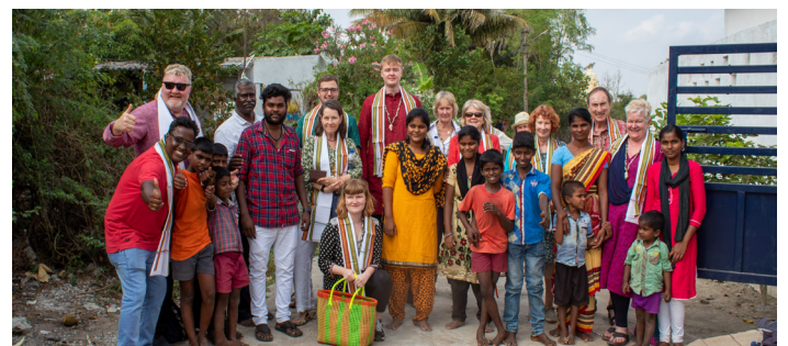
Visitors trip with CARE staff and local children, 2020

During the visit, you will meet all three of our partner organisations and witness first-hand the impact your donations are making. The visit also includes attractions in a variety of Southern Indian cities.