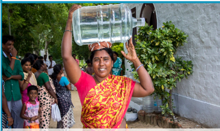
Water from reverse osmosis plant

The rural poor are without running water in their homes and they mostly rely on government pipelines. Unfortunately, these pipelines, which supply water to a central water tank, are often inadequate, and irregular and the water is of poor quality. On top of this, salt intrusion of local water tables is a growing problem.