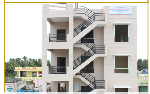
The Rural Development Centre (RDC)

In 2018 a much needed three-storey Rural Development Centre (RDC) for MASARD was built. The building is a multi-functional space, acting as a counselling office, admin office, meeting room, and training centre. In 2020 a community kitchen facility was built for our partner CRUSADE. The space caters for celebrations, Self Help Group and staff meetings.