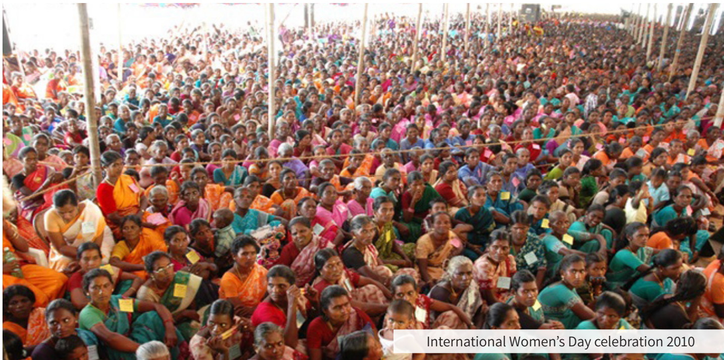
International Women's Day celebration 2010

All of us here at Salt of the Earth would like to thank each of you most profoundly for your generosity which has enabled us to pass the £5 million income mark.