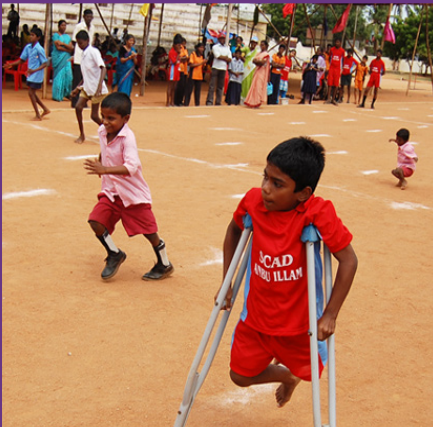
Sports day at a residential school

In a society where most live hand to mouth in poverty, the plight of the disabled is even more difficult. What little government money there is available is often impossible to access because of ignorance and illiteracy and job opportunities are extremely limited. Parents of children born with disabilities are often ostracised leaving them without help of any kind.