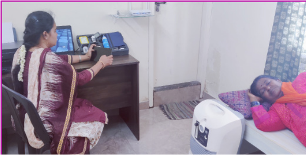
Patient receiving support from MASARD staff & online clinic service at RDC

As well as mobile clinics, MASARD has launched a cloud-based online clinic in their catchment area. We have funded the setup of the scheme which included a subscription fee for an online medical service and technology for the Rural Development Centre. The online medical service (Medi360) is specifically designed for marginalised communities. Villagers can book online consultations with doctors across India who provide advice and referrals to the rural poor.