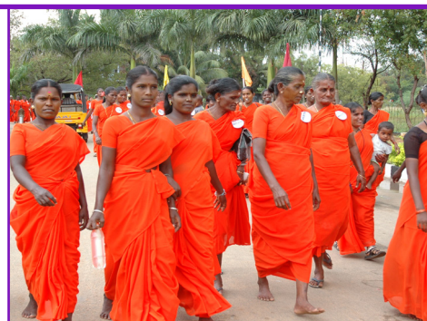
A march for women's rights, early 2000s

From 2020-2021, we launched two emergency appeals to provide aid during India's Covid crisis. The appeals raised over £80,000 and provided food, water, medical support and hope to many thousands of marginalised families. The appeal funded extracurricular schooling that taught and fed children for 18 months in the complete absence of government education.