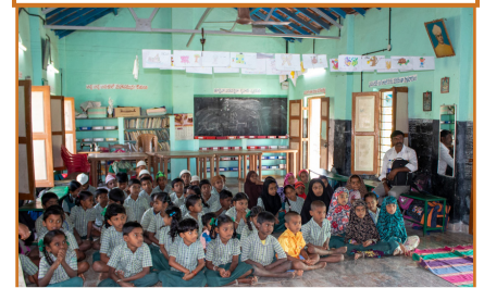
New granite floor in primary school

School premises and facilities are often inadequate and poorly maintained and many schools have been helped. Toilet blocks, fresh water facilities, granite floors and teaching equipment such as smart boards have all been provided.