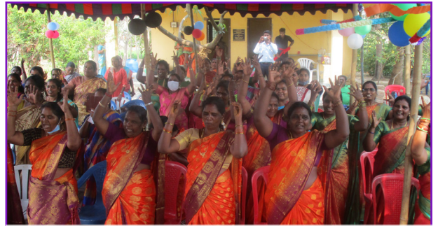
Women's Day celebrations in action

CRUSADE celebrated International Women's Day on 19th March at their community kitchen compound. The 80 attendees included self-help group members, CRUSADE staff, health care workers and special guests from the Panchayat and local universities. The event featured speeches from local dignitaries, poem readings, and celebrations of CRUSADE's recent achievements. Man Vasam, (meaning 'The smell of the Earth') a cultural group from Chennai Loyola College, entertained the audience with a folk arts performance.