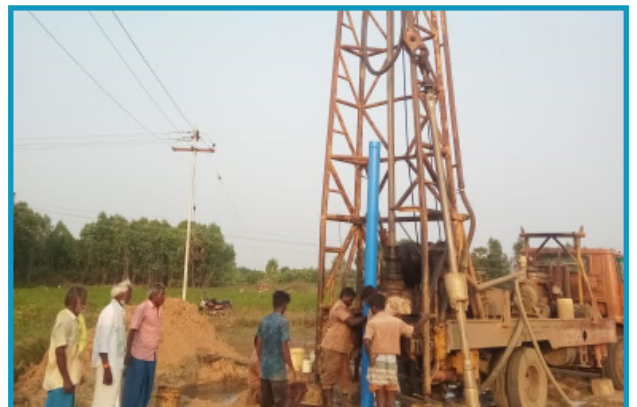
S.Medu village borewell construction

In 2021 we funded three village water generation projects with CRUSADE. The final borewell was drilled in December at 150ft deep, and three motor pumps were installed. The project was delayed due to heavy rainfall, but CRUSADE has now completed the construction. As the land is Panchayat owned, they have agreed to support this project by digging pits for tree planting before the onset of the monsoon season.