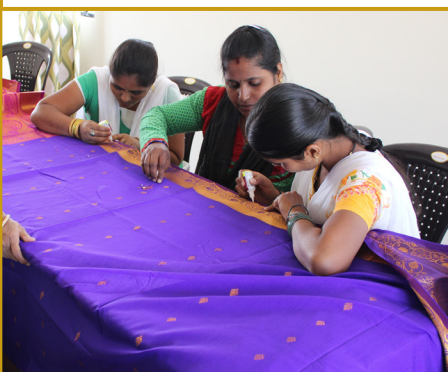
Women learning sari embellishment

By empowerment of rural people through skills training workshops, many families have been helped to create sustainable incomes. Over the years, close to 3,000 men and women have been trained in tailoring, embroidery, wire bag making, animal rearing, hair and beauty services, pottery, or sari embellishment. Training programmes have enabled people to become self-sufficient and build savings.