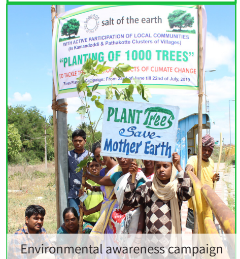
Environmental awareness campaign